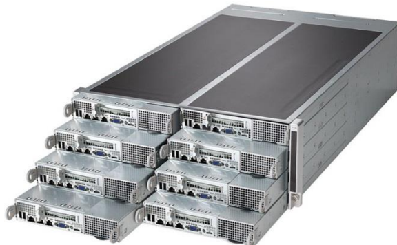
Figure 3: Supermicro FatTwin™ (SYS-F618R3-FTL)

The E5 v4 based FatTwin™ system demonstrated a 26% improvement in performance over the previous generation E5 v3 based system. Performance-per-watt improvement with the E5 v4 based system was 25%. These data are shown in Table 3.