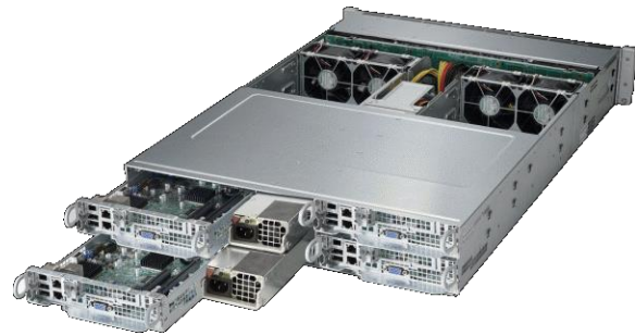
Figure 2: Supermicro TwinPro 2™ (SYS-2028TP-HTR)

The E5 v4 based 2U TwinPro 2™ system shown in Figure 2 demonstrated a 26% improvement in performance over the identical system configured with previous generation E5 v3 CPUs and memory. Performance-per-watt was also significantly higher at 29% with the new generation system. These data are shown in Table 2.