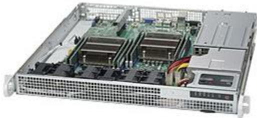
Figure 1: Supermicro DCO (SYS-6018R-MDR)

The E5 v4 based DCO system (Figure 1) delivered 27% better performance and 27% better performance-per-watt than the E5 v3 based DCO system, as shown Table 1.